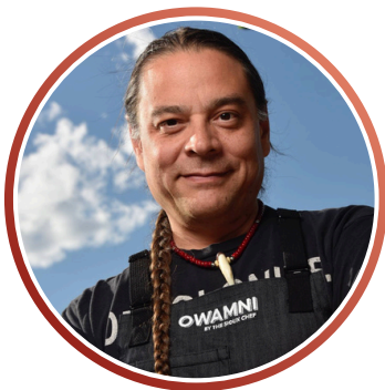
CHEF SEAN SHERMAN

Founder/Executive Director: NĀTIFS Founder/CEO: The Sioux Chef and Owamni by The Sioux Chef